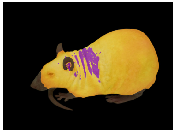
Figure 2 Two types of skin in a rat. Two images of a genetically hairless (Crl:CD-Hrhr) rat exposed to cold are overlaid. The bottom layer is a regular (visible spectrum) photograph. The top layer is a transparent infrared thermogram. In the thermogram, temperatures from 31.0 to 37.0 °C are coded with yellow (from dark to light respectively), temperatures below 31.0 °C are coded with black, and temperatures above 37.0 °C are coded with purple. As a result, the vasoconstricted skin over the heat-exchange organs shows as black, whereas the skin over the rest of the body is yellow. The external acoustic meatus and the skin over interscapular brown adipose tissue have higher temperatures and show as purple.

The proximally located and insulated hairy skin seems to be a bad place to assess ambient temperature. Indeed, no one would think that putting a thermometer under the clothes of a warmly dressed man on a cold day would give an accurate reading of the ambient temperature. Sticking a thermometer under the fur of a polar bear may not work well either. Furthermore, temperature in some areas of the hairy skin, for example the rostral back in the rat, is strongly affected by the thermogenesis in the underlying brown adipose tissue (Marks et al. 2009) (also see Fig. 2). An important fact from the clinical point of view is that temperature of hairy skin in the body's nooks and crannies (e.g. the external acoustic meatus and axilla) often approaches